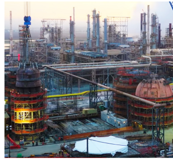
Chevron Richmond's FCCU, during major repairs