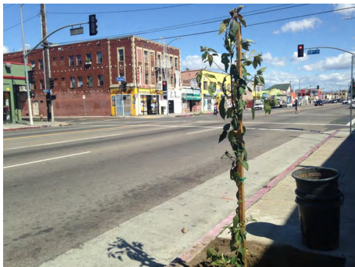
The organization City Plants spearheaded the installation of 120 trees on Broadway in South L.A. in April, partially to combat urban pollution.

Latinos represent a majority of the top ten percent of most of the polluted areas, although only 37.6 percent of California residents are Latino.