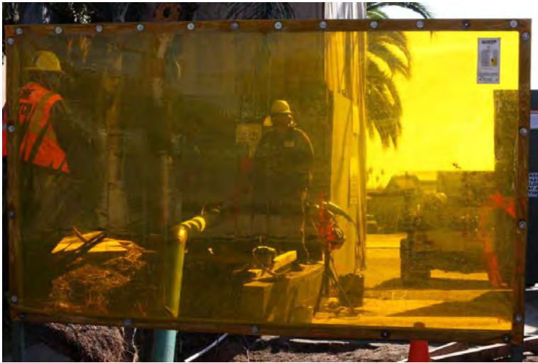
A look into the Murphy oil drilling site in the residential West Adams neighborhood of South L.A.