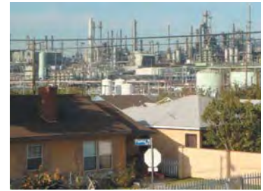
Wilmington CA neighbors against Phillips

Tar Sands will make already-high sulfur corrosion risk in California refineries even worse - this crude oil has extremely high sulfur content. Even without highest-sulfur crude, the Chevron Richmond refinery in Northern CA exploded Aug. 2012 (at left), narrowly missed killing 19 workers, sending thousands to hospitals. The U.S. Chemical Safety Board found this was due to sulfur corrosion and lack of maintenance.