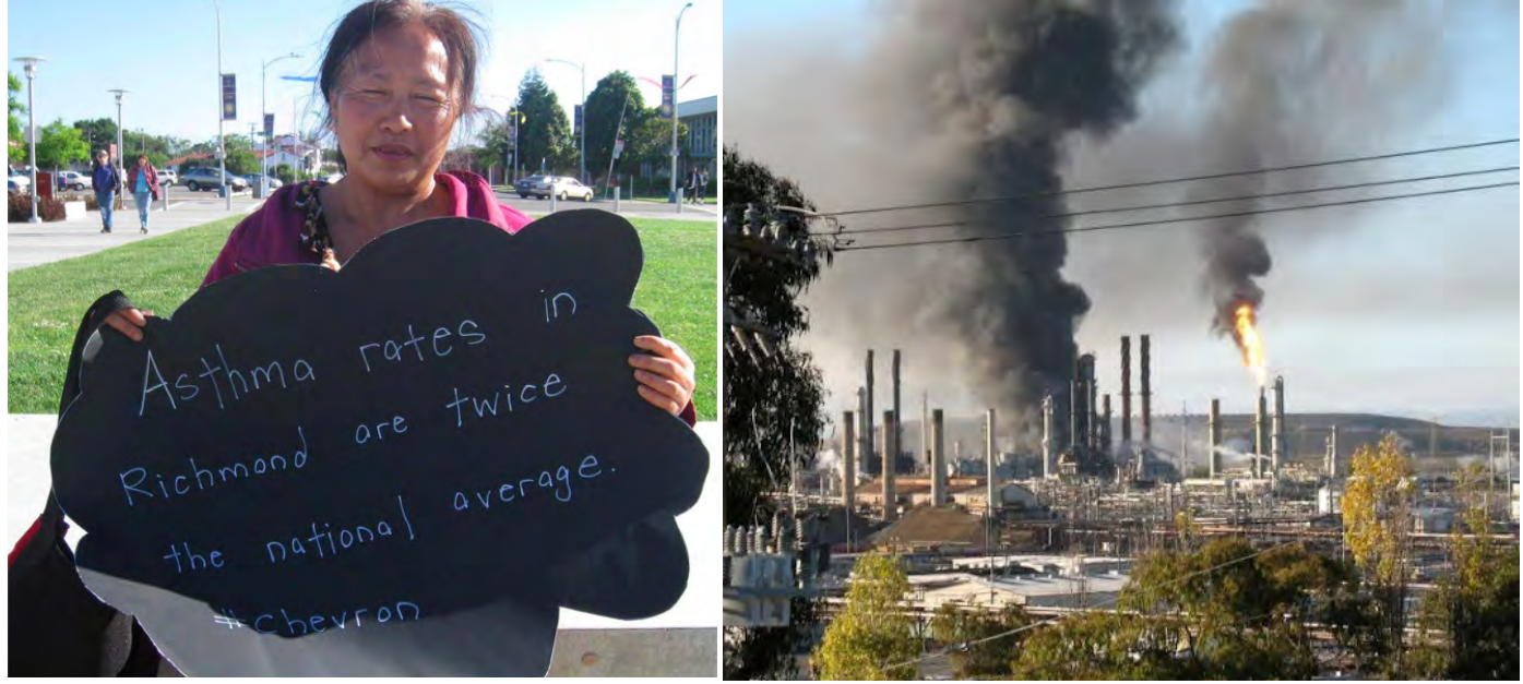
The Chevron refinery explodes in August 2011, sending approximately 15,000 people to the hospital.